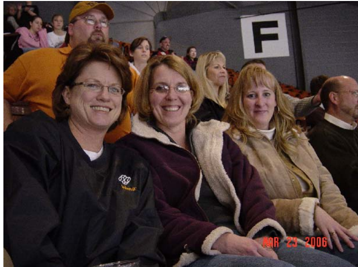
Enjoying the Stampede hockey game held March 23, 2006