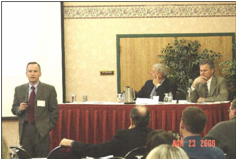
Forum was presented on March 23, 2006 on the Future of Healthcare Financing.